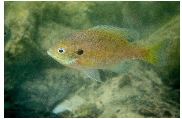
Bluegill sunfish are native to the Great Lakes basin and get their name from a darkened blue spot on their gills.