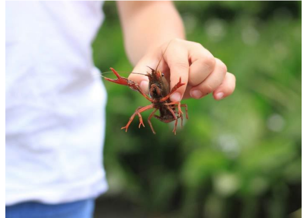
Kind of cute, but big trouble: an invasive species

Students first read about mysterious population changes in a freshwater ecosystem, then create line graphs to show the changes over time. They think about what might be causing the changes and brainstorm with a partner about how the changes might be causing problems in the freshwater ecosystem. Lesson options are listed in the “Enrich/Extend” section.